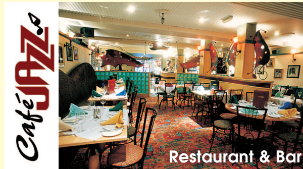
Restaurant & Bar

Cardiff International Arena, Saint David's Hall, Public swimming pools, Sports and Leisure centres, Castles, Museum and Beautiful Gardens, to name but a few – not forgetting the fantastic Cardiff Bay development. We're also within walking distance of the Millennium Stadium.